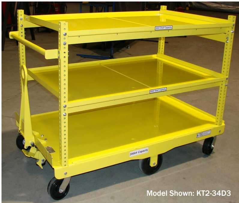
Model Shown: KT2-34D3