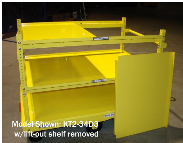
Model Shown: KT2-34D3 w/lift-out shelf removed