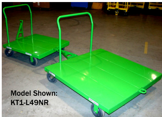
Model Shown: KT1-L49NR