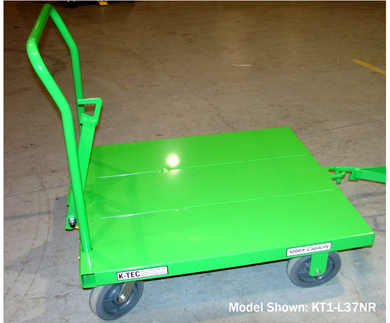
Model Shown: KT1-L37NR

K-Tec's standard ProFlow™ Series of carts with ergo-support products™ such as lifts and conveyors provide higher capacity and an integrated material flow solution. A "try before you buy" demo program for qualified customers delivers a hands on look at specific approaches without wasting investment dollars.