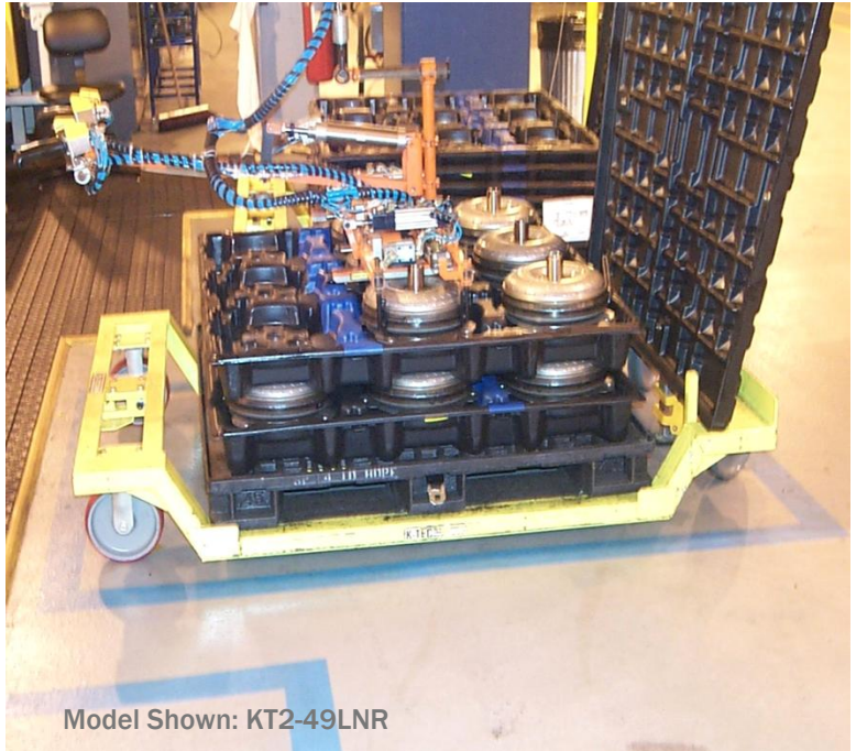
Model Shown: KT2-49LNR

K-Tec also designs ergo-support products such as lifts and conveyors to provide an integrated, dependable solution. A “try before you buy” demo program for qualified customers delivers a hands on look at our products without wasting investment dollars.