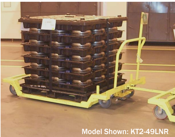
Model Shown: KT2-49LNR

K-Tec identifies and benchmarks relevant applications, addresses ergo/safety issues and provides on-site feasibility reviews where required. Application engineers are available by conference call or direct appointment to help walk through the early planning and front end design phase of lean material flow projects. 2