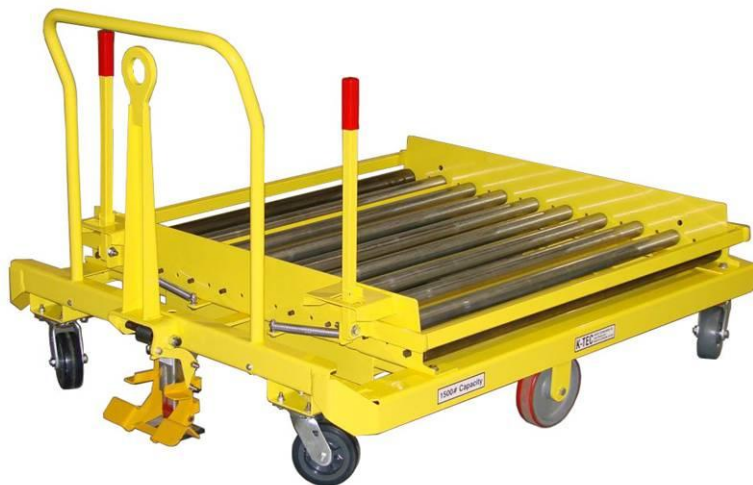
Model Shown: KT2-49NRC.13”