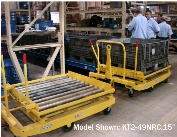
Model Shown: KT2-49NRC.15”